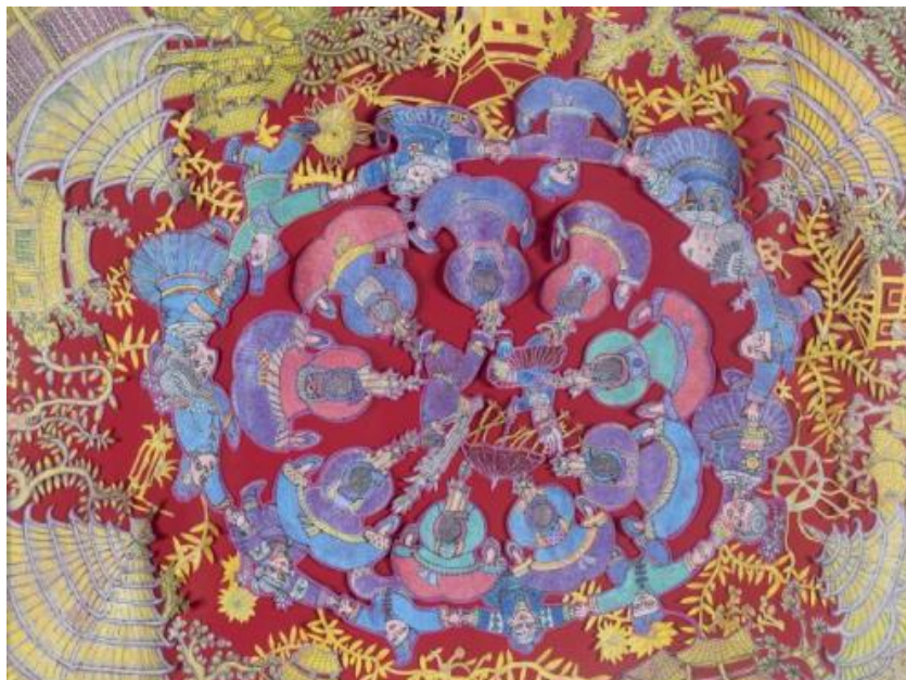
Figure 6. Wu Chunbing's "reed-pipe wind instrument treading on a parade hall"

forms of folk art include paper-cutting, Dong brocade, embroidery and architecture. The aesthetic ideals of folk art include the beauty of life and the beauty of good fortune.