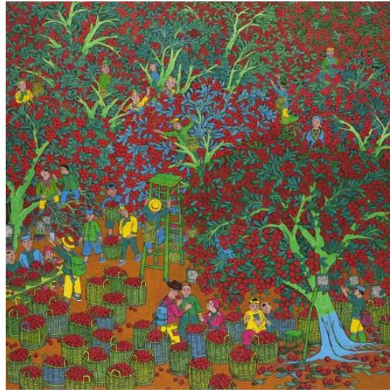
Figure 3. Pang Yongpei's "Home in May"

for payment in the picture show the new life and new atmosphere of the Dong farmers, a thriving scene (Figure 3).