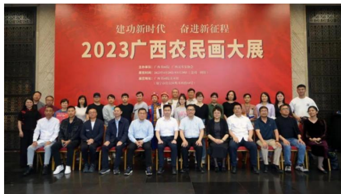
Figure 2. Group photo at the opening ceremony of the Guangxi Peasant Life Painting Exhibition 2023

The 2023 Guangxi Painting and Calligraphy Academy, together with the Guangxi Artists Association, jointly organized the 2023 Guangxi Peasant Life Paintings of Life Painting Exhibition under the strong leadership of the Propaganda Department of the Party Committee of the Autonomous Region (Figure 2). This year, a total of 1,179 pieces of works were received, including 544 pieces of peasants' paintings in the region and 653 pieces of peasants' paintings outside the region. After rigorous preliminary and reevaluation by experts, 174 works were finally selected, including 3 first prizes, 5 second prizes, 10 third prizes, 18 excellence prizes, and 19 Green Seedling Prizes (Chen & Jia, 2023). Among them, 54 pieces of Sanjiang Dong peasant life painting were awarded and selected, 1 piece of second prize, 1 piece of third prize, 3 pieces of excellence prize, 18 pieces of Green Seedling Prize, and 31 pieces of selected prize.